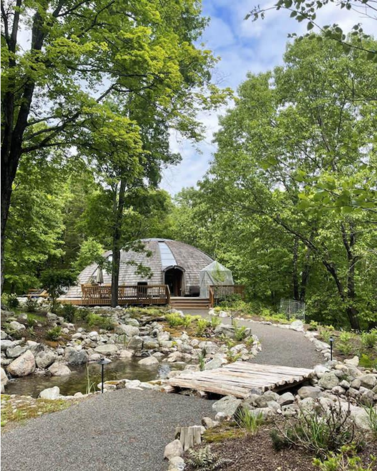
Exterior of the house above