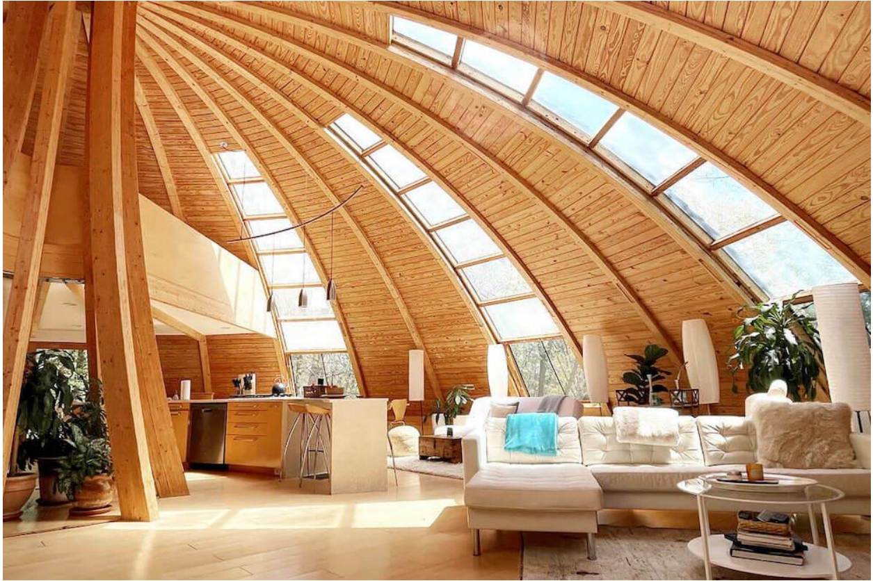
Stunning Hudson Valley Round House Vacation Rental