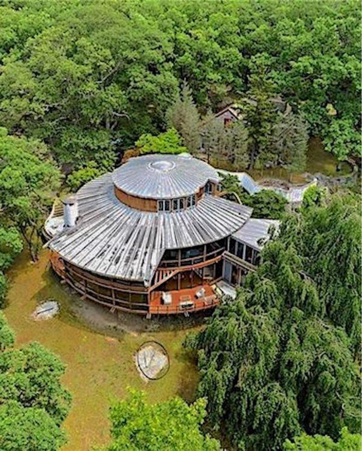
Known as the Mothership